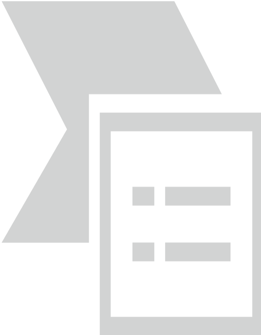
Fig. 2. Unweighted pair-group method using arithmetic averages cluster analysis phenogram showing the relationships among the 69 tomato accessions.

Principal component analysis:- The first five components of the PCA explained 78.4% of total variations among the accessions, with the first two PCs contributing