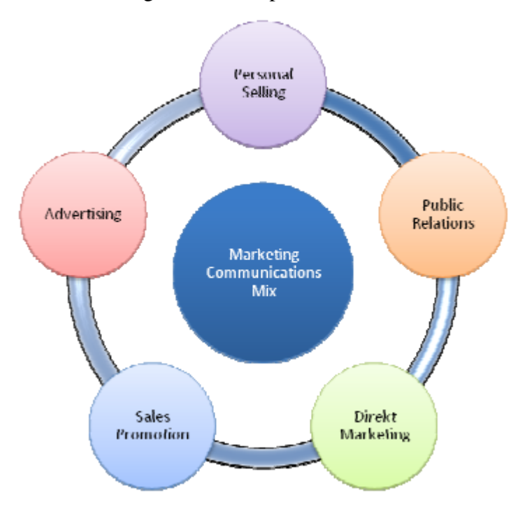
Figure 1. Marketing communication

The purpose of marketing communication is to contact the target market and establish a line of verbal exchange between the company and the buyer. As a result, the "advertising communication mix" depicted in Determination 1 is used in marketing communications. Advertising, personal promotion, family public members, direct advertising, and revenue sales are most of the five verbal exchange channels that make up the advertising communication mix. These multiple ad hoc communication (marcom) components (see Fig. 2) form the impetus for business enterprise-to-commercial enterprise conversation. The next paragraph will describe the composition and emphasis of the male or female segments in the MARCOM mix to have a higher understanding of their composition and concentration.